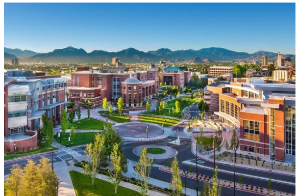
University of Nevada at Reno