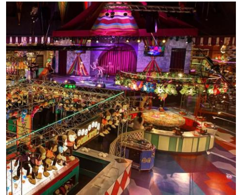
Circus Circus Resort

Spend the weekend at The Circus Circus casino resort for a whimsical, family fun experience. Catch a free tour at the Kimmie Candy production facility to satisfy your sweet tooth. Test your brain at the Puzzle Room , where each room bring a new and puzzling challenge. Explore science and technology through hands-on activities at the Discovery Museum . Stop by the Sierra Safari Zoo to spend the afternoon learning about exotic wildlife.