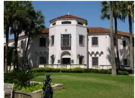
McNay Art Museum