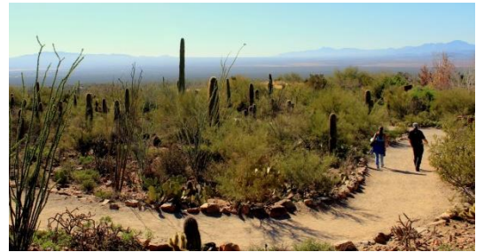
Arizona-Sonora Desert Museum