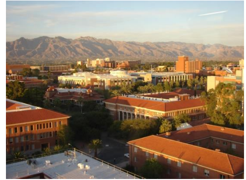
University of Arizona