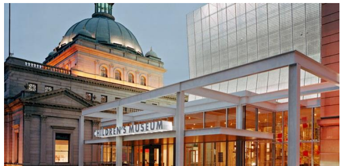
Pittsburgh Children's Museum