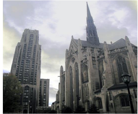
University of Pittsburgh