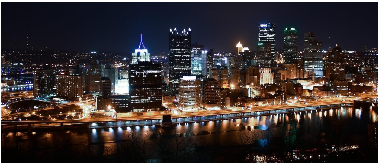
Pittsburgh Skyline at night

*If a holiday falls on a Sunday, the day following is observed as the legal holiday.