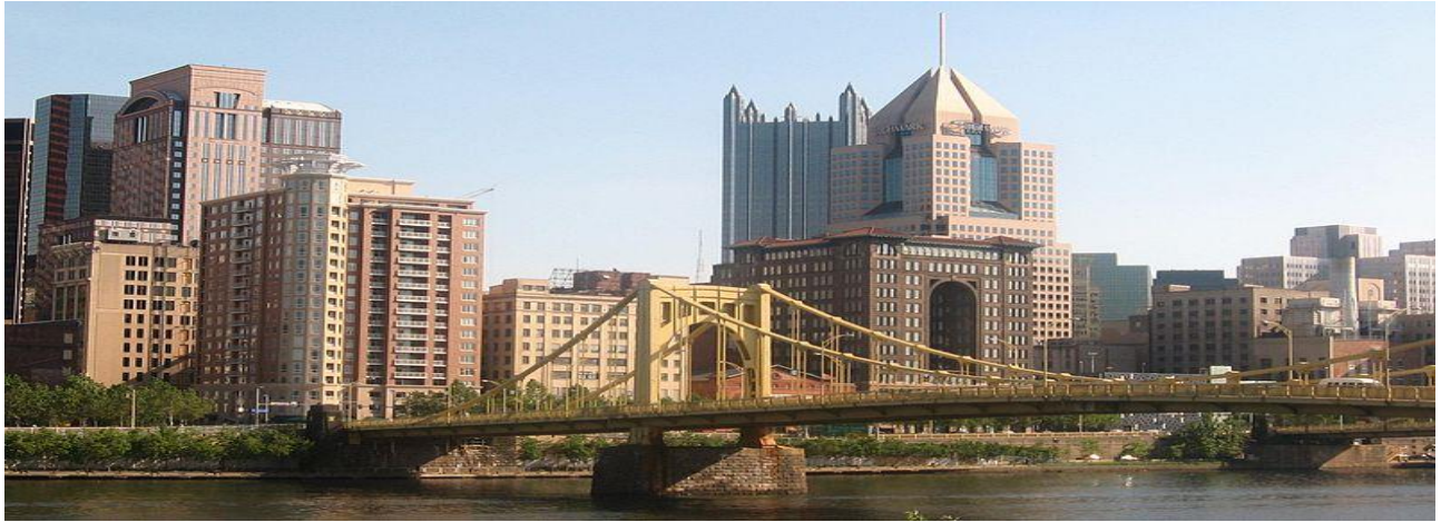
Pittsburgh skyline

Pittsburgh is the second-largest city in the Commonwealth of Pennsylvania (to Philadelphia) with a population of 305,842 and the county seat of Allegheny County. The Combined Statistical Area population of 2,659,937 is the largest in both the Ohio Valley and Appalachia and the 20th-largest in the U.S.A. Pittsburgh is known as both "the Steel City" for its more than 300 steel-related businesses, as well as "the City of Bridges" for its 446 bridges. The city features 30 skyscrapers, 2 inclines, a pre-revolutionary fortification and the source of the Ohio River at the confluence of the Monongahela and Allegheny rivers. This vital link of the Atlantic coast and Midwest through the mineral-rich Alleghenies made the area coveted by the French and British Empires, Virginia, Whiskey Rebels, Civil War raiders and media networks.