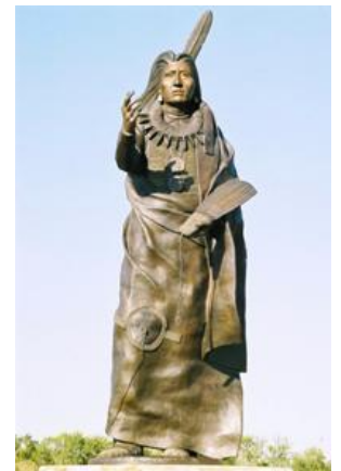
Standing Bear Memorial