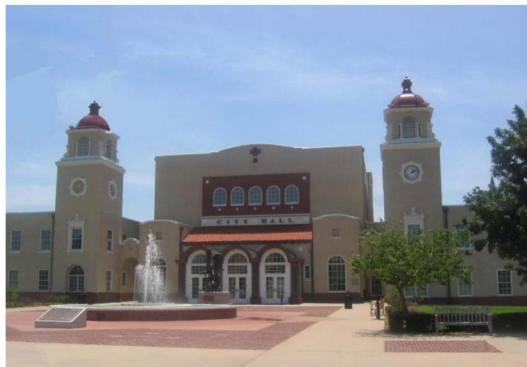
Ponca City, City Hall