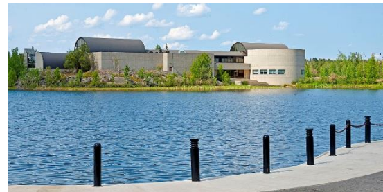
Prince of Wales Northern Heritage Centre