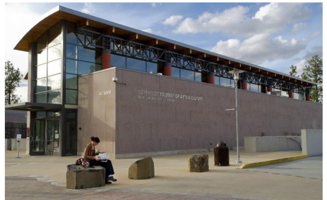
The Museum of Arts and Culture