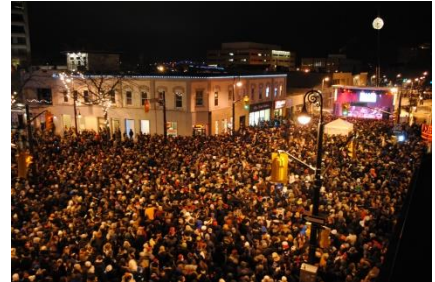
New Year's Eve in Sarnia