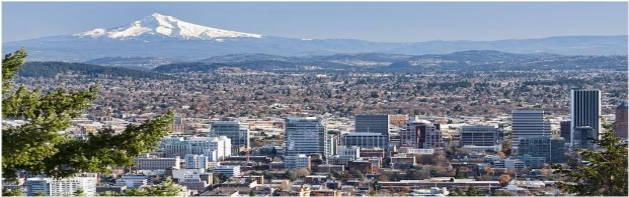
Photo of Portland