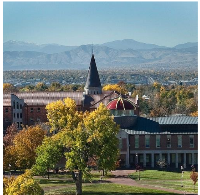
University of Denver