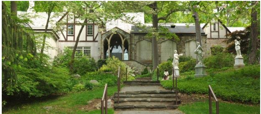
Stamford Museum and Nature Center