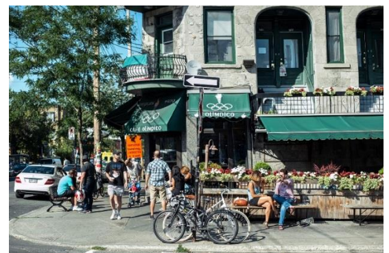
Café Olimpico in Mile End

Thanks to the multicultural composition of this vast city, Montreal has many eateries offering a multitude of different cuisines. Good quality and great value restaurants abound in Montreal, with different cuisines featured in separate areas. Chinatown is always a hit with authentic food and some new age cocktail bars like Le Mal Necessaire . Montreal's Mile End neighborhood has cultivated a "hipster" reputation for its restaurants where going is as much about the ambiance as it is the food. Some good affordable places are also located here if you're looking for a fun and cool night out with friends. Little Italy/Petite-Patrie of course has some incredible first class Italian food, but there's also so much more cuisine to explore here. Also Montreal offers Syrian and Vietnamese restaurants to try and plenty of vegetarian restaurants for those of you who prefer a dish with no meat!