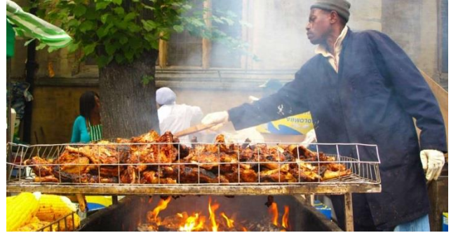
Montreal during a Jamaican food festival