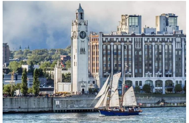
Old Montreal, Island located in Old Port

There is so much to see and do in Montreal with Montreal's beautiful skyline, interesting history, European style, lively art scene and so much more. Don't miss seeing Old Montreal , the district that is characterized as a Parisian-style quarter with buildings that date back to the 17 th and 18 th centuries. It has many historic sights and landmarks best seen on an afternoon stroll. Here you can find the Parisian twin of Notre-Dame Basilica and the historic quays of the Old Port .