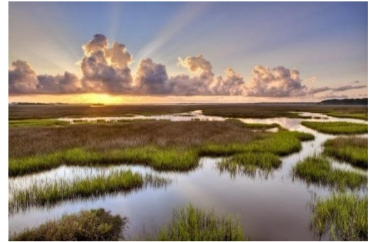
Timucuan National Park