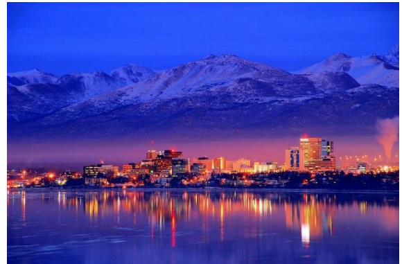
Anchorage Alaska Skyline

Known for the abundance of outdoor activities and natural beauty, Anchorage is a city that balances a thriving metropolitan area with beautiful scenery. The residents enjoy visiting the national parks, observing glaciers, seeing a vast amount of wildlife, and biking the many trails. If enjoying the great outdoors isn't your go-to activity, there are plenty of art exhibits, fine restaurants, and downtown entertainment in the area as well.