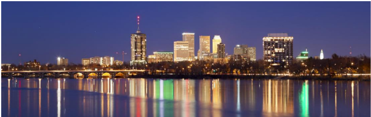
Tulsa City Skyline, Night time

*If a holiday falls on a Sunday, the day following is observed as the legal holiday.