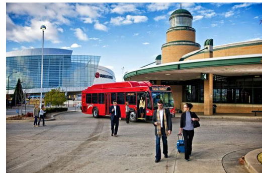
Denver Ave. Station

Transit maps are available on the Tulsa Transit website . Information on fares and passes , transit stations and more are also available on the transit website.