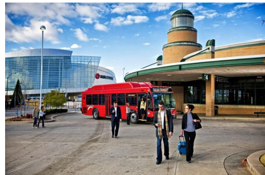
Denver Ave. Station

Transit maps are available on the Tulsa Transit website . Information on fares and passes , transit stations and more are also available on the transit website.