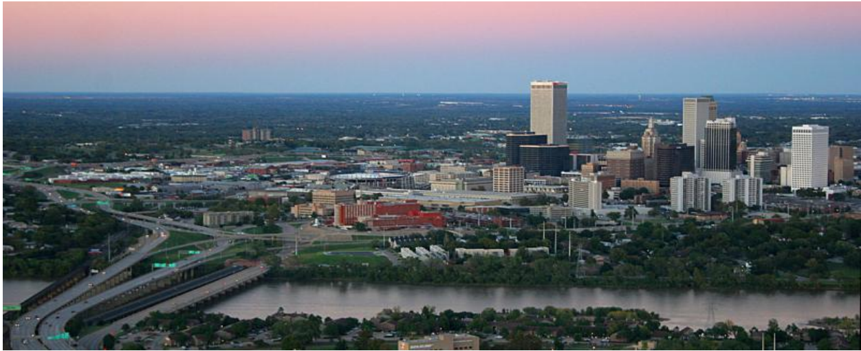
Tulsa Skyline

Tulsa is the second-largest city in the state of Oklahoma with a population of 403,090 and the county seat of Tulsa County. The Metropolitan Area has a population of 981,005 and the Combined Statistical Area population is 1,151,172, leading this county to be the most densely populated in the state. Tulsa was known as the “Oil Capital of the World” for it was a vital city for the American oil industry. In the past, the city relied on its energy sector in order to thrive, but in recent years, the city has diversified its economic sectors to include finance, aviation, technology, and telecommunication. Tulsa is also known as the cultural and arts center of Oklahoma with its wide variety of art deco architecture, art museums, opera, and more.