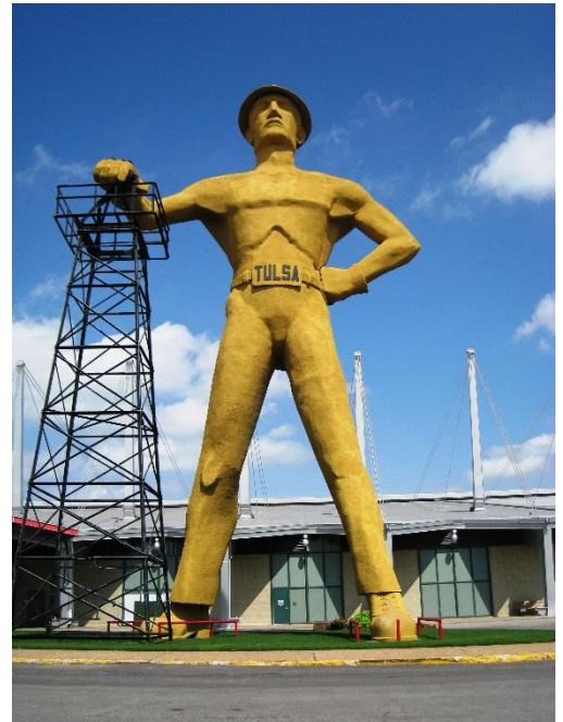
The Golden Driller