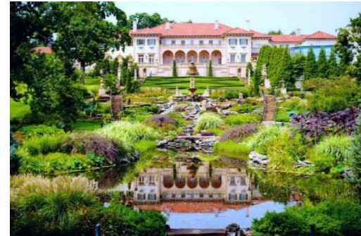
Philbrook Museum of Art