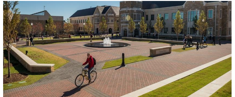
The University of Tulsa