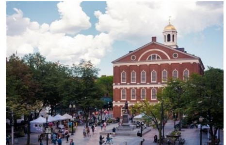
Faneuil Hall