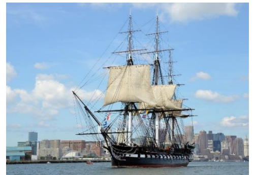
USS Constitution