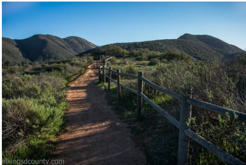
Mission Trails Park