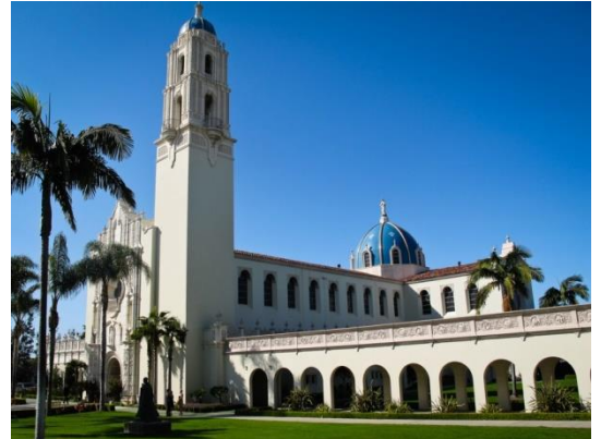
University of San Diego