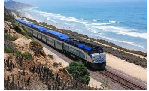
San Diego Coaster

COASTER : The COASTER commuter train provides breathtaking coastal scenery as it runs north and south through San Diego County, serving eight stations between Oceanside and downtown San Diego. More than 20 trains run on weekdays, with additional service on the weekends. It takes about an hour to travel the entire COASTER route.