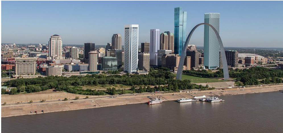
St. Louis Skyline

St. Louis, named for King Louis IX of France, was founded in 1764 as a French fur-trading village by Pierre Laclède. Prior to European settlement, the area was a major regional center of Native American Mississippian culture. When Thomas Jefferson signed the Louisiana Purchase in 1803, St. Louis was already a 40-year-old river town.