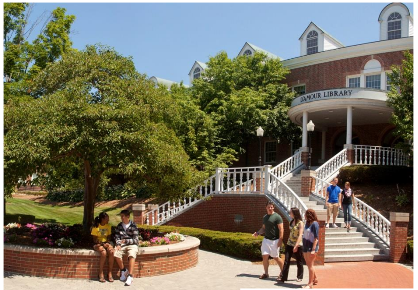
Western New England University