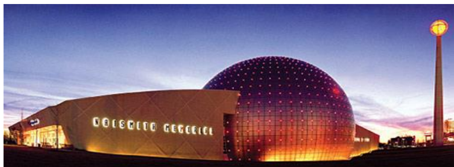
Basketball Hall of Fame