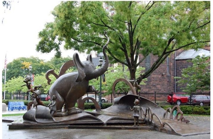
Dr. Seuss National Memorial Sculpture Garden