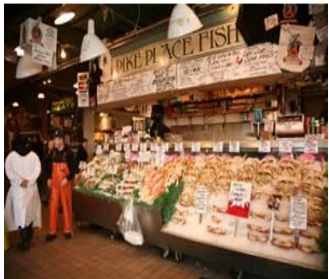
Pike Place Fish Market