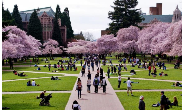
University of Washington