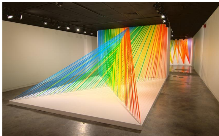
Salt Lake Art Center