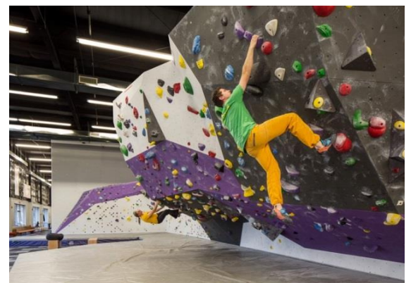
Approach Climbing Gym