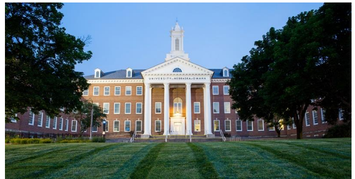
University of Nebraska at Omaha.