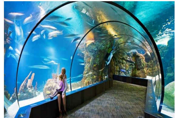
Omaha Zoo.

Walk across a swinging rope bridge suspended over a tropical rainforest at Omaha's Henry Doorly Zoo and Aquarium . Hop aboard historic train cars at The Durham Museum . Discover Omaha's past through the Douglas County Historical Society's Tombstone Tour. Climb in, on, and through everything imaginable at the Omaha Children's Museum . Catch the spectacular Heartland of America Fountain with its 320-ft water jet and light show. Lewis & Clark Interpretive exhibits, WWII and Airborne Memorial Sculptures and a pedestrian bridge connecting to the Lewis & Clark Landing.