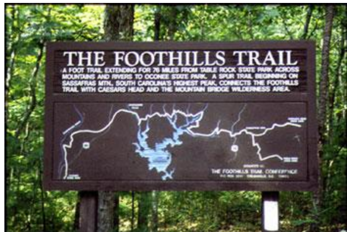
Foothills Access Trail in Oconee State Park