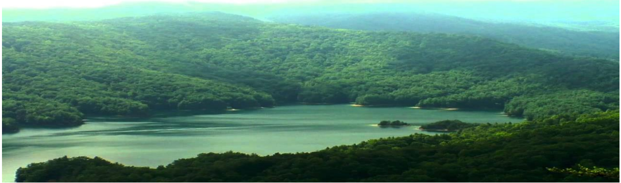
Photo of Oconee County, SC

Oconee County is the westernmost county in the U.S. state of South Carolina. As of the 2010 census, the population was 74,273. Its county seat is Walhalla. Other cities in Oconee County are Seneca, Westminster, Salem, West Union, Long Creek, Fair Play, Mountain Rest, and Newry. Oconee County is in the Savannah River basin.