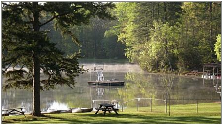
Oconee State Park

Adopt a pet from Oconee County Humane Society .