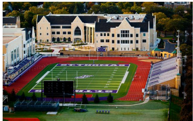
University of St Thomas