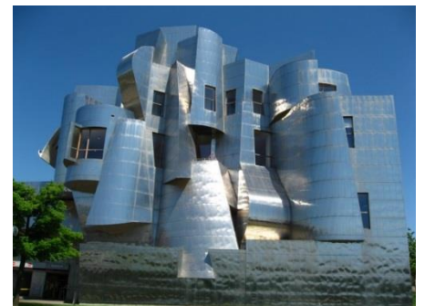
Frederick R. Weisman Art Museum