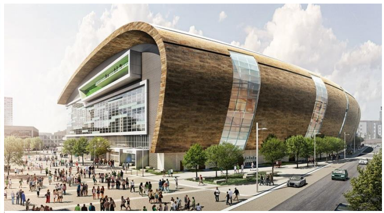
Milwaukee Bucks Arena