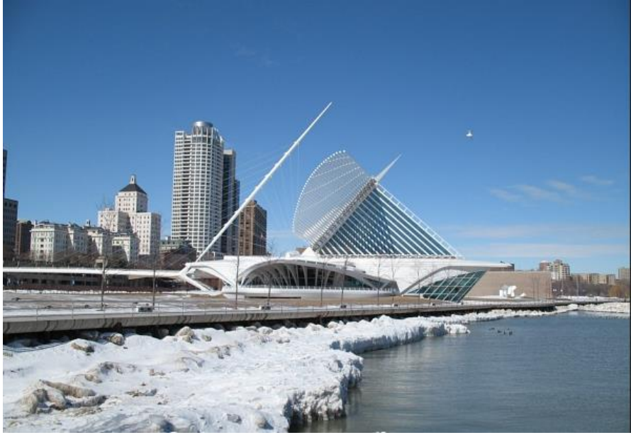
Milwaukee Art Museum