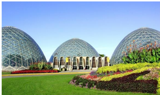
Mitchell Park Horticultural Conservatory