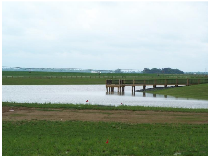
Charles E Price Memorial Park

Other attractions include two playgrounds, nine pavilions of varying size, and charcoal grills. This destination is a popular spot for waterfowl, so bring your binoculars. You will likely see ducks, Canadian geese, and snow geese, especially during fall and winter.