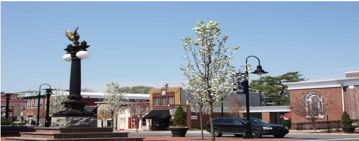
Downtown Middletown, DE

Middletown, Delaware, located about 24 miles south of Wilmington, is an early crossroads town, one of the old Delaware towns not on a navigable waterway. It was originally a tavern stop about half-way on the old cart road that extends across the peninsula between Appoquinimink Creek in Odessa and Bohemia Landing on the eastern branch of the Bohemia River in Maryland; thus the name, "Middletown."