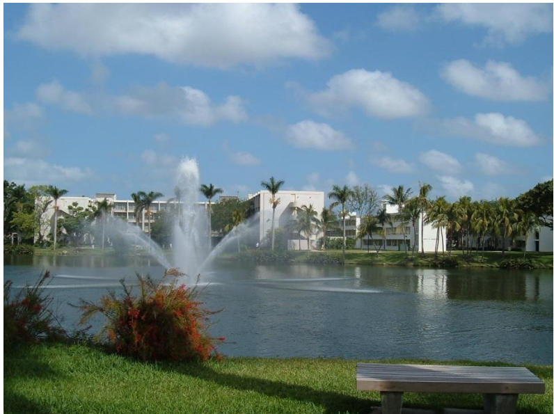
University of Miami