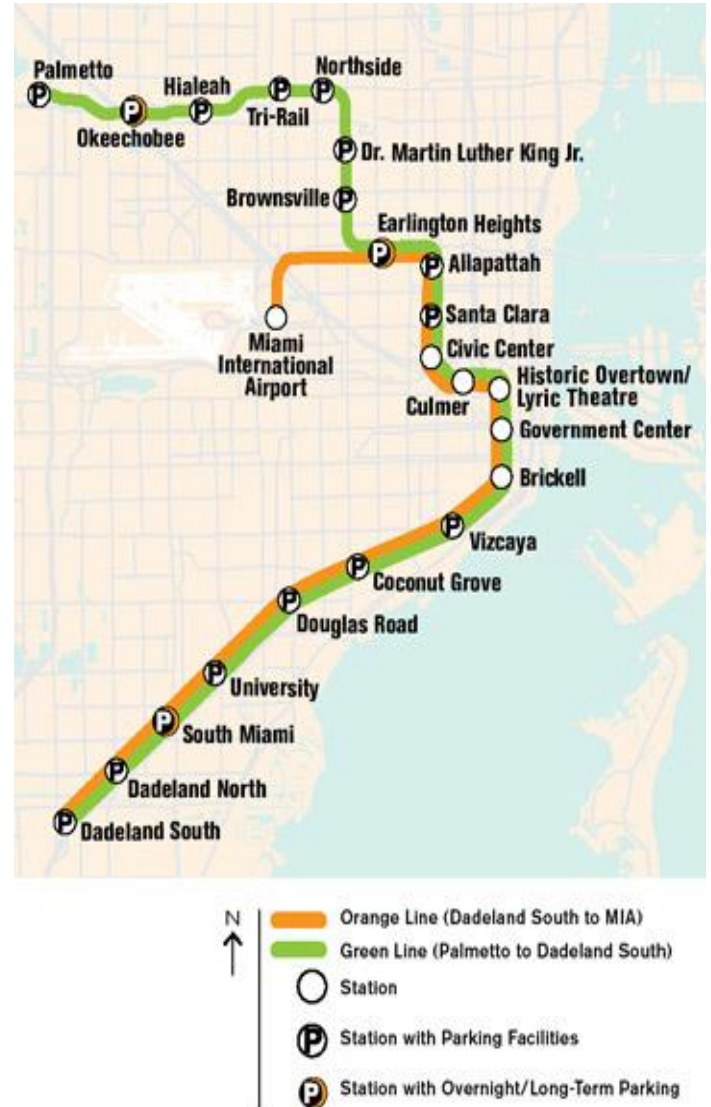
Miami Metrorail Map

Transit Fares for Metrobus and Metrorail may be discounted when a monthly pass is purchased.