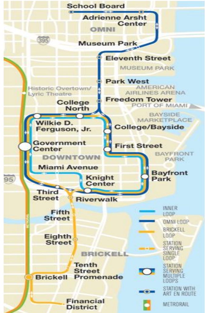
Miami Metromover Map

All taxis are fitted with maps of the barrier islands which state the cost per location. The same applies for passengers leaving the islands onto the mainland, though normal rates apply for person traveling by taxi within the islands or within the mainland.