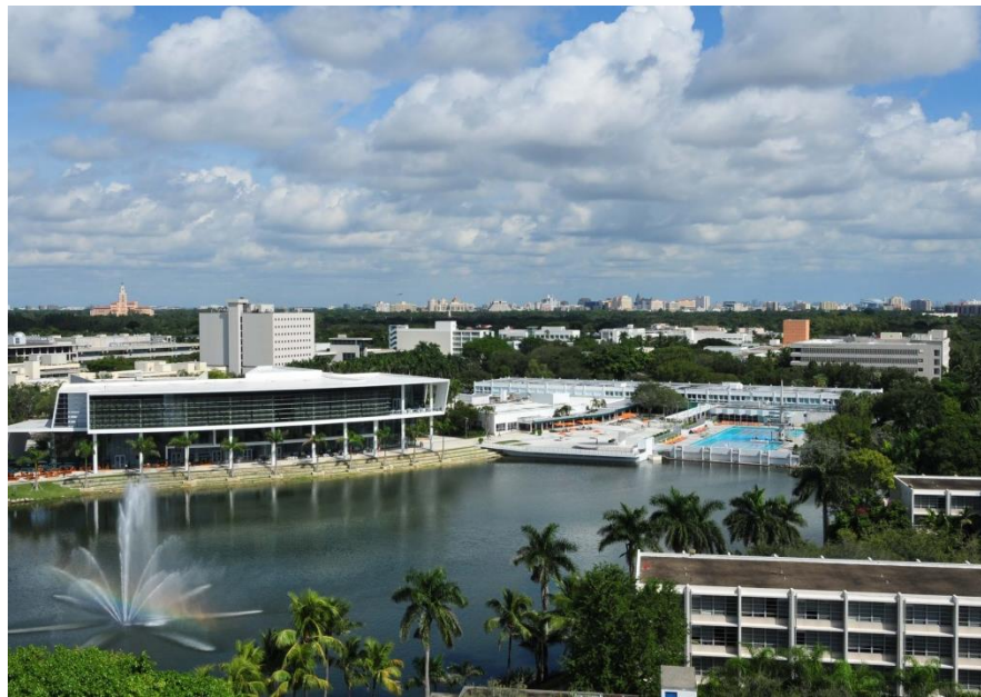
University of Miami