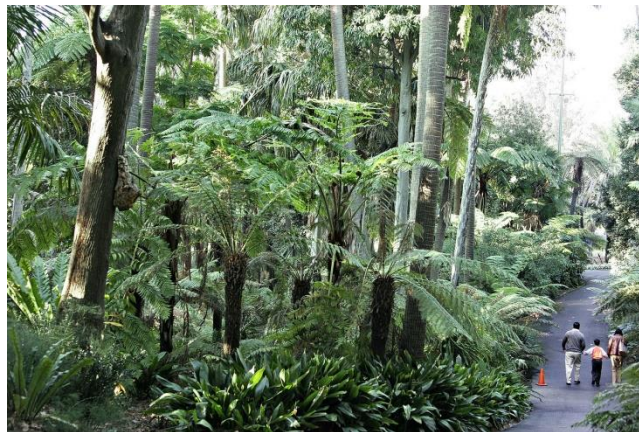
Melbourne's Royal Botanic Garden