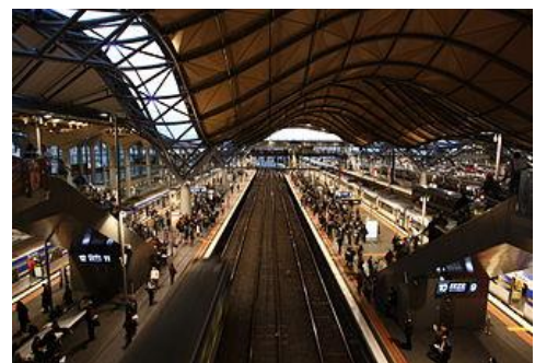
Southern Cross Station

Link to High-Resolution map of Melbourne's train network