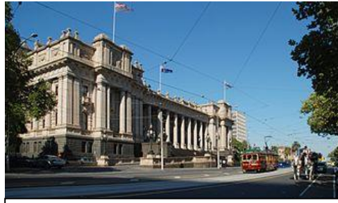
City Circle Tram in front of Parliament House

Lovely, laid-back Melbourne has something for everyone: family fare, local and international art, haute boutiques, multicultural dining, Australian and Aboriginal history, spectator sports, and pulsing, swanky nightlife. Cruise on the free City Circle Tram loop to check out unique attractions like the Royal Botanical Gardens and the Healesville Sanctuary, which buzzes with local animal species.