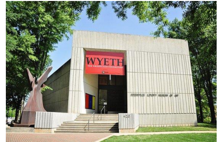
Greenville County Museum of Art