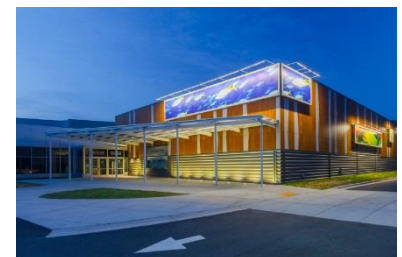
Greensboro Science Center

Near Greensboro, Guilford Courthouse National Military Park has displays on the American Revolution.