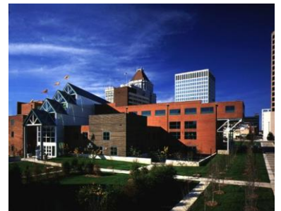
Greensboro Cultural Center

Greensboro Science Center boasts a 12-acre zoo, an aquarium and a hands-on museum, plus a theatre with a 40-foot screen.