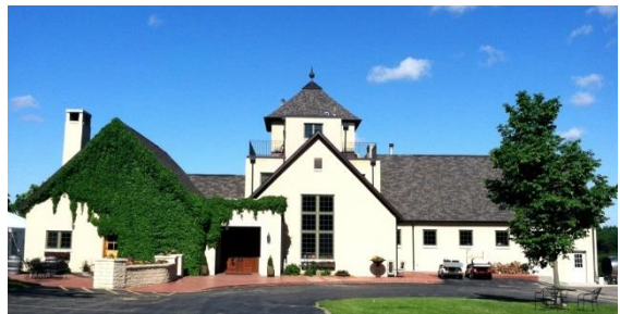
Photograph Courtesy of tillersandtravelers