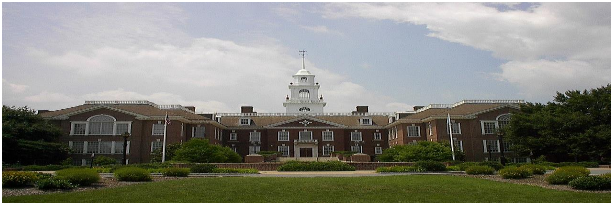
Legislative Hall in Dover, DE

The City of Dover is located in Central Delaware in Kent County and is the capital of Delaware. Dover is approximately 90 miles south of Philadelphia, PA, and 90 miles east of Washington, DC. While its population is significantly less than that of Wilmington, Delaware, Dover encompasses a larger area than any other city on the Delmarva Peninsula. In contrast to most major cities in the Northeast United States, Dover is continuing to grow economically, in population, and in land area. The City has an estimated population of 37,540 and a total land area of approximately 26,000 acres. Living in Dover, you will experience a vibrant downtown, a very attractive historical district and well established neighborhoods, as well as brand new subdivisions.