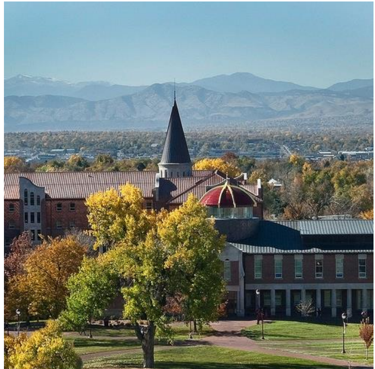
University of Denver