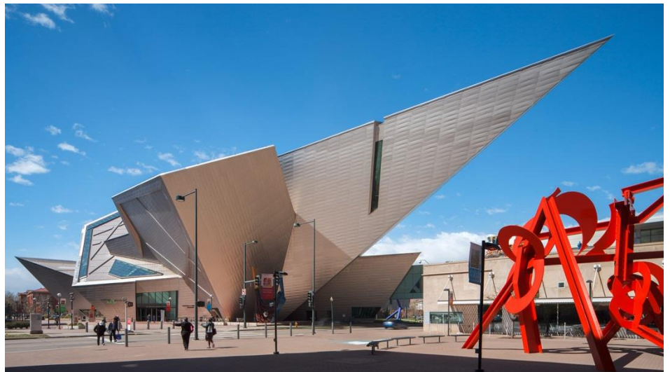
Denver Art Museum