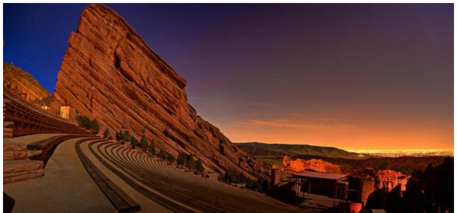
Red Rocks Amphitheatre