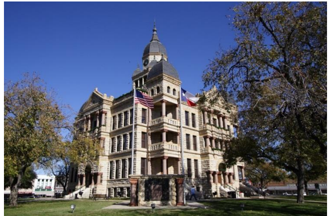
Courthouse on the Square