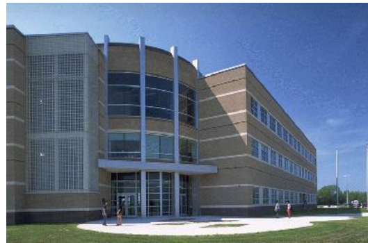
North Central Texas College