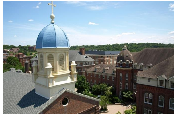
University of Dayton