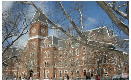
The Ohio State University