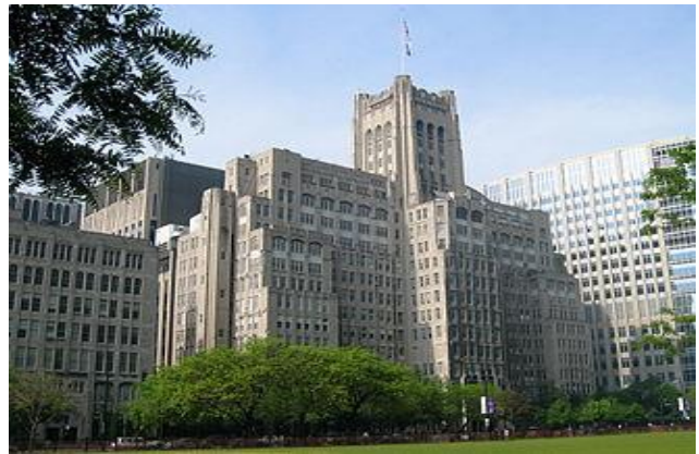
Northwestern's Feinberg School of Medicine in Chicago