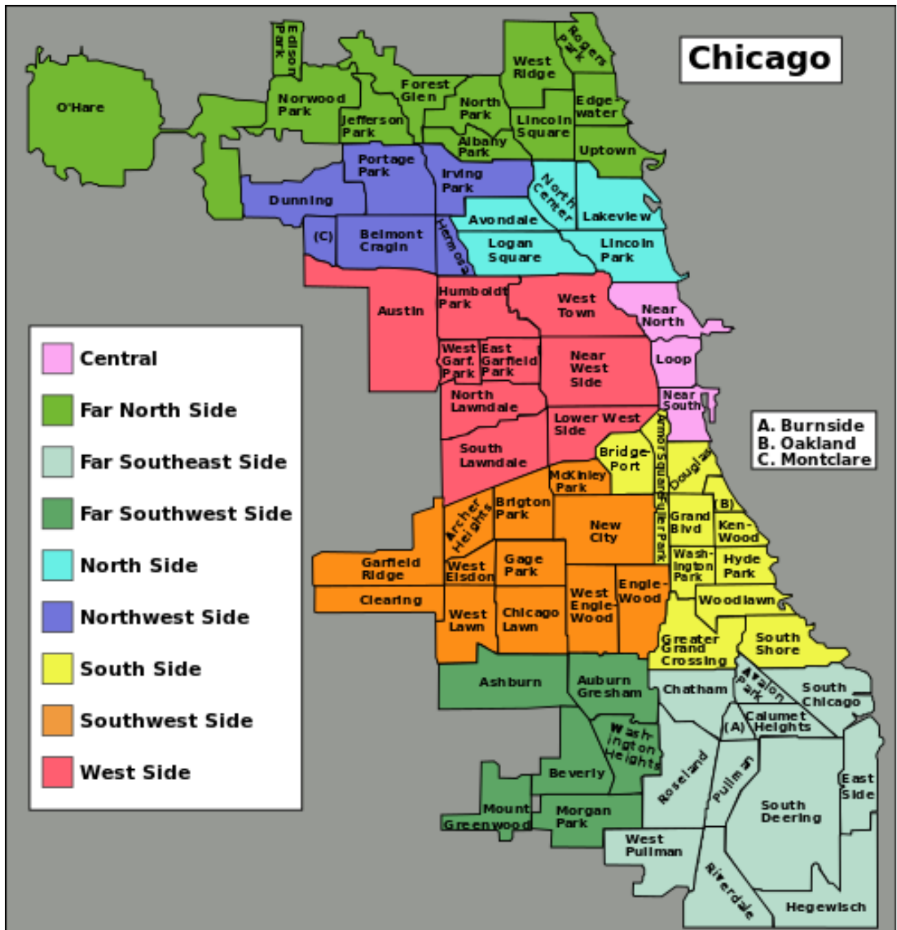
Map courtesy of Wikimedia Commons