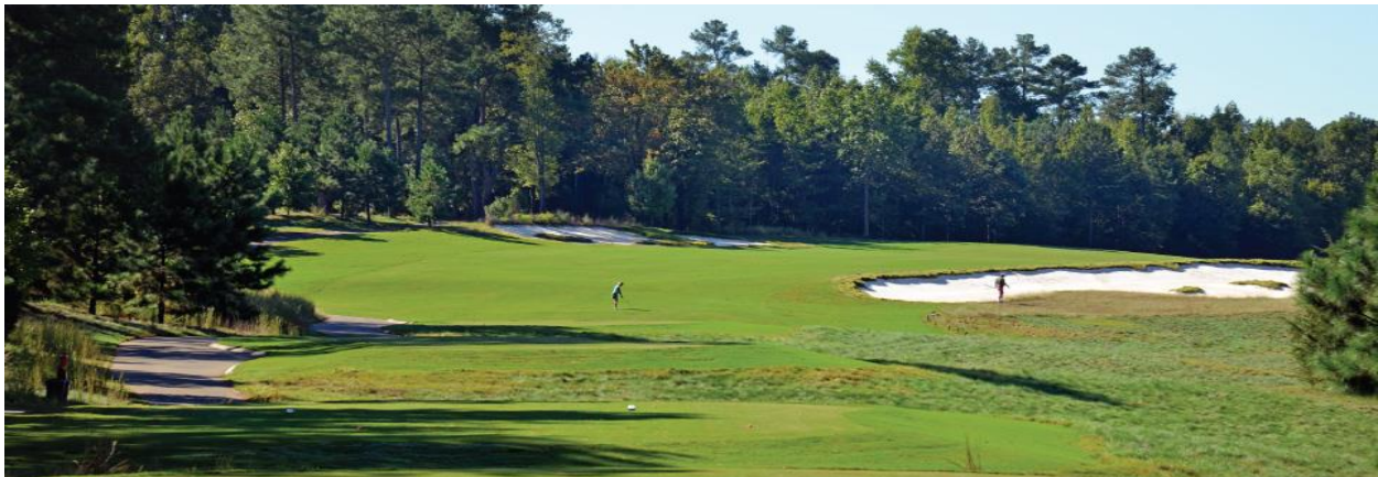
Photo of Lonnie Pool Golf Course

There are many other sporting opportunities in Charlotte such as golfing. Golf is an easily accessible sport to many in Charlotte due to the abundance of public golf courses. The Lonnie Pool Golf course in particular covers over 200 acres and was designed by Arnold Palmer and his team. Rates range from $25-$50 and tee times can be made a maximum of seven days in advance. An added bonus: This course features great views of the Charlotte skyline.