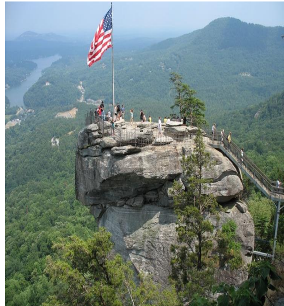
Photo of chimney Rock State Park