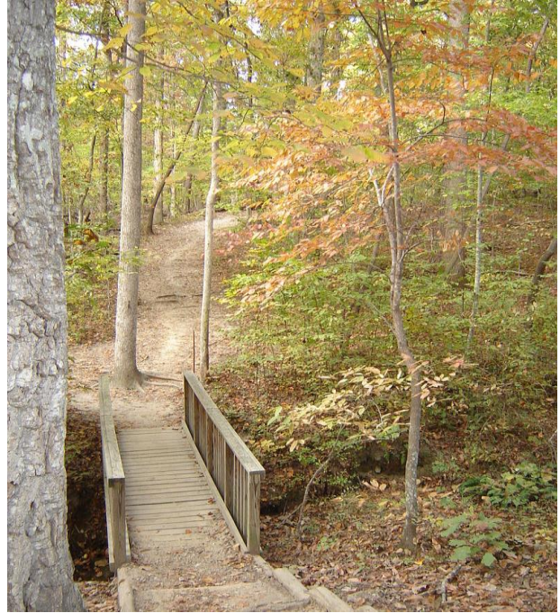
Photo of Umstead State Park

For both novice and seasoned runners, there is an abundance of races starting from 5k to marathons in the Charlotte area. There are many fun events, such as the mud race where people dress up as either zombies or humans and race through an obstacle course, or the Great Glow Run where the race begins at 8:30pm allowing you to run under the stars.