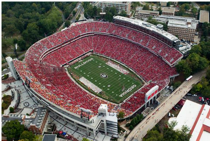
University of Georgia