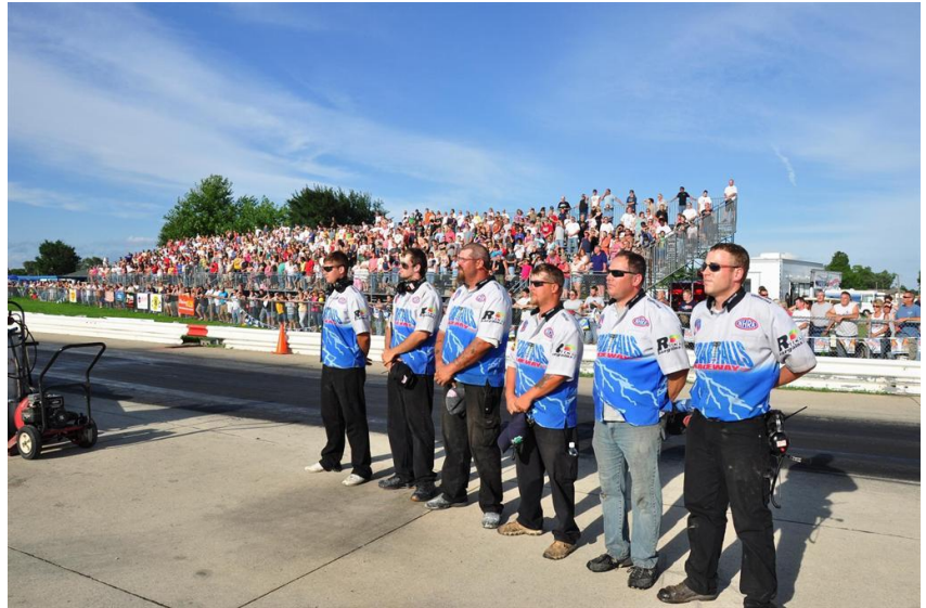
Cedar Falls Raceway