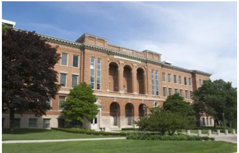
University of Northern Iowa