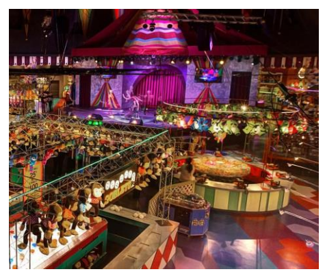
Circus Circus Resort

Spend the weekend at <u>The Circus Circus casino resort</u> for a whimsical, family fun experience. Catch a free tour at <u>the Kimmie Candy</u> production facility to satisfy your sweet tooth. Test your brain at the <u>Puzzle Room</u>, where each room bring a new and puzzling challenge. Explore science and technology through hands-on activities at the <u>Discovery Museum</u>. Stop by the <u>Sierra Safari Zoo</u> to spend the afternoon learning about exotic wildlife.