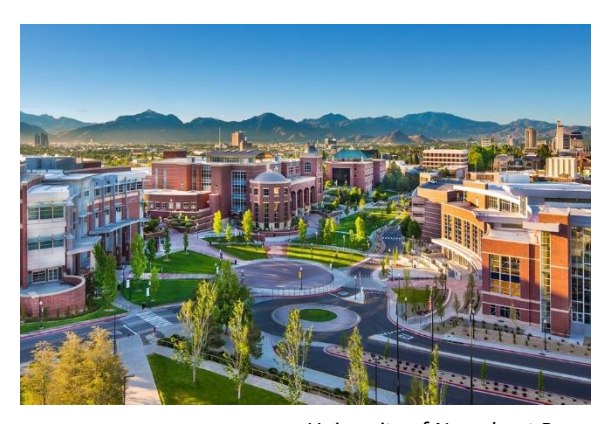
University of Nevada at Reno