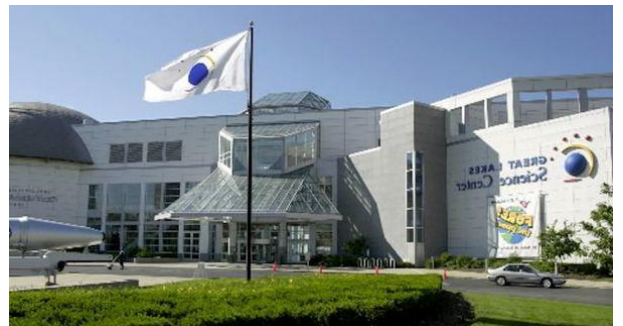
Great Lakes Science Center