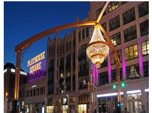
Playhouse Square