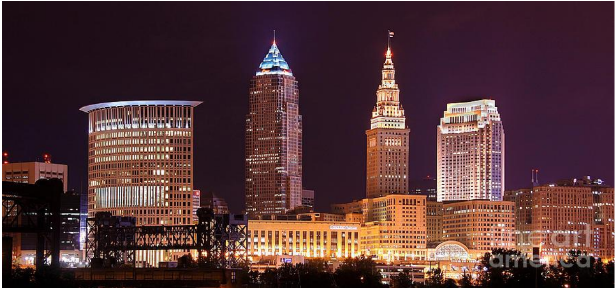
Cleveland Skyline at Night

*If a holiday falls on a Sunday, the day following is observed as the legal holiday.