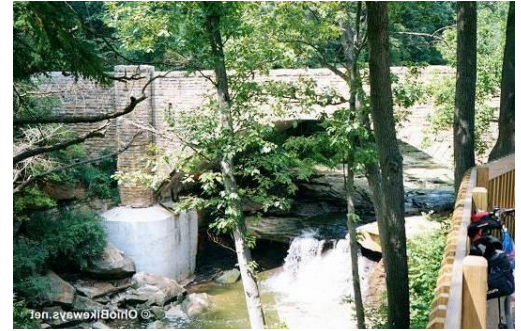
Emerald Necklace Trail System