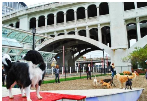
Cleveland dog park