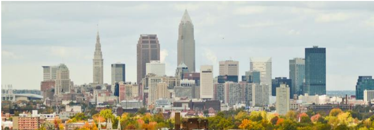
Cleveland skyline

Cleveland , the county seat of Cuyahoga County, is the second-largest city in the state of Ohio (to Columbus) with a population of 389,520. The Combined Statistical Area population of 3.5 million is the 15th-largest in the U.S.A. Cleveland is known as "the Forest City" for its surrounding green environment, as well "The CLE" and "The Land", which have been coined by locals. The city features 5 skyscrapers, a historic national park, the riverbed of Lake Erie, and the mouth of the Cuyahoga River. Cleveland serves as a vital link between the Atlantic coast and Midwest via the Erie Canal, which connects the Great Lakes to the Atlantic Ocean. During U.S. industrialization, Cleveland thrived within the iron ore and coal transportation industries.