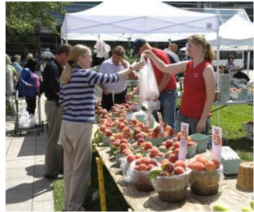
North Union Farmers' Market