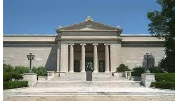
Cleveland Museum of Art