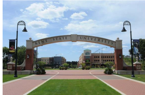
Kent State University