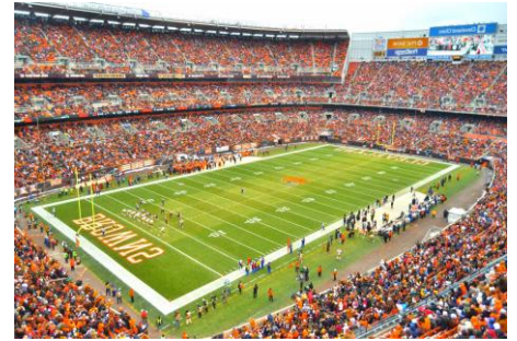
First Energy Stadium