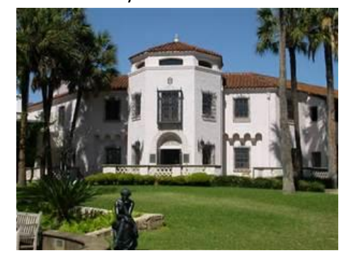
McNay Art Museum