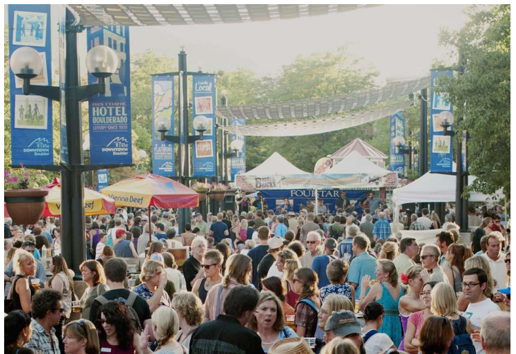
Band on the Bricks Festival