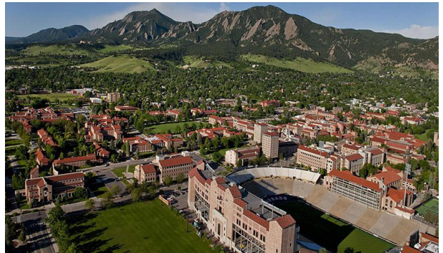
The University of Colorado-Boulder