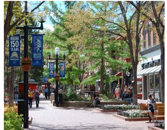
Pearl Street Mall