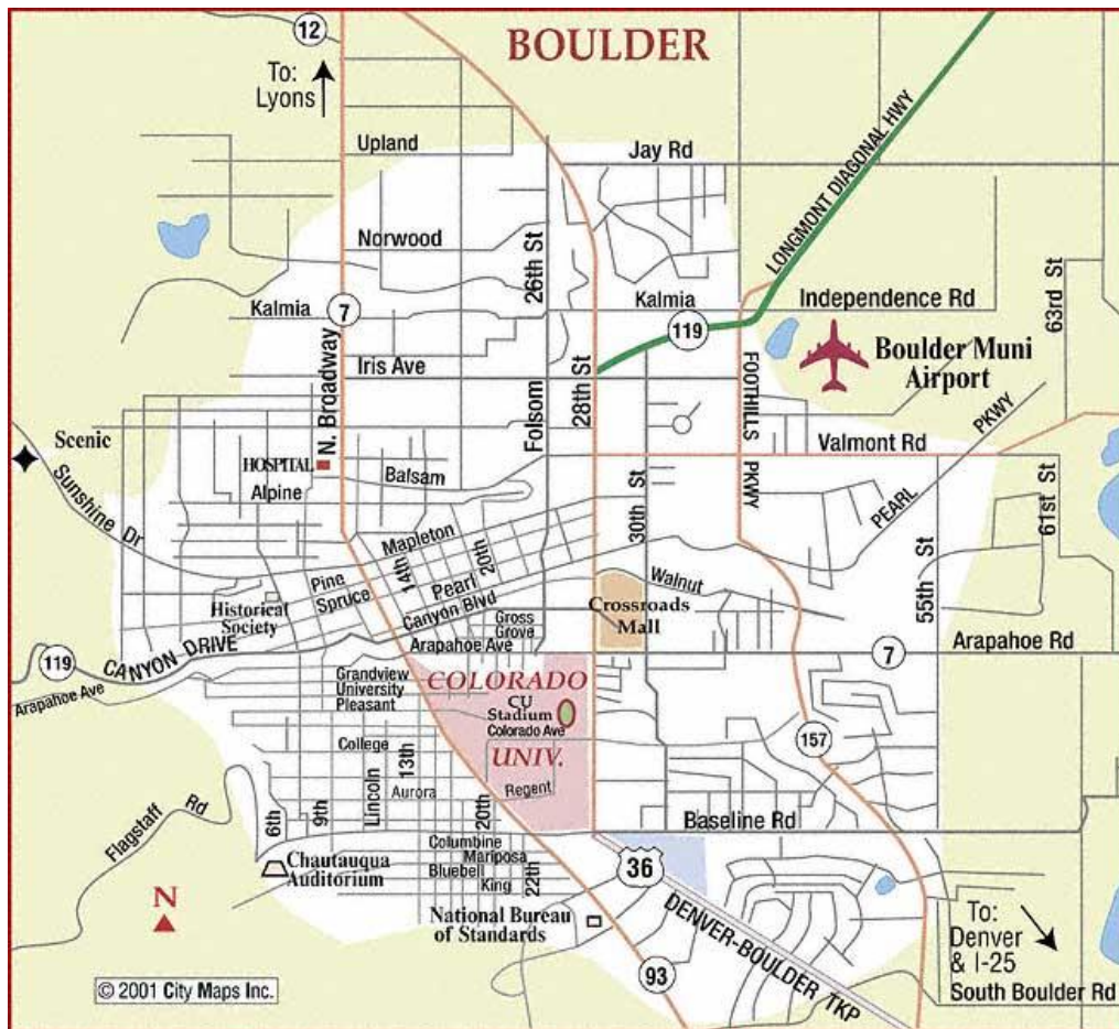
Map courtesy of AccessMaps

When you eat in a restaurant in America, you are expected to leave your server a tip, as it is not included. In a bar, café, or modest restaurant, 15% of the total bill is acceptable. However, in an upscale restaurant (fine dining), a tip calculated on 20% of the total bill is the norm. In Denver, Boulder, and Colorado Springs, tips are a very important part of certain workers' income, and gratuities are the standard way of showing appreciation for services provided. (Tipping is certainly not compulsory if the service is poor!)