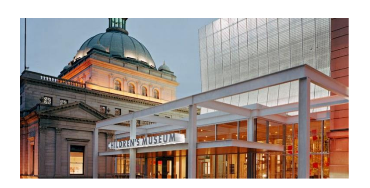
Pittsburgh Children's Museum