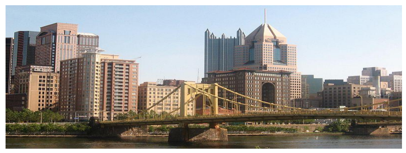
Pittsburgh skyline

Pittsburgh is the second-largest city in the Commonwealth of Pennsylvania (to Philadelphia) with a population of 305,842 and the county seat of Allegheny County. The Combined Statistical Area population of 2,659,937 is the largest in both the Ohio Valley and Appalachia and the 20th-largest in the U.S.A. Pittsburgh is known as both "the Steel City" for its more than 300 steel-related businesses, as well as "the City of Bridges" for its 446 bridges. The city features 30 skyscrapers, 2 inclines, a pre-revolutionary fortification and the source of the Ohio River at the confluence of the Monongahela and Allegheny rivers. This vital link of the Atlantic coast and Midwest through the mineral-rich Alleghenies made the area coveted by the French and British Empires, Virginia, Whiskey Rebels, Civil War raiders and media networks.