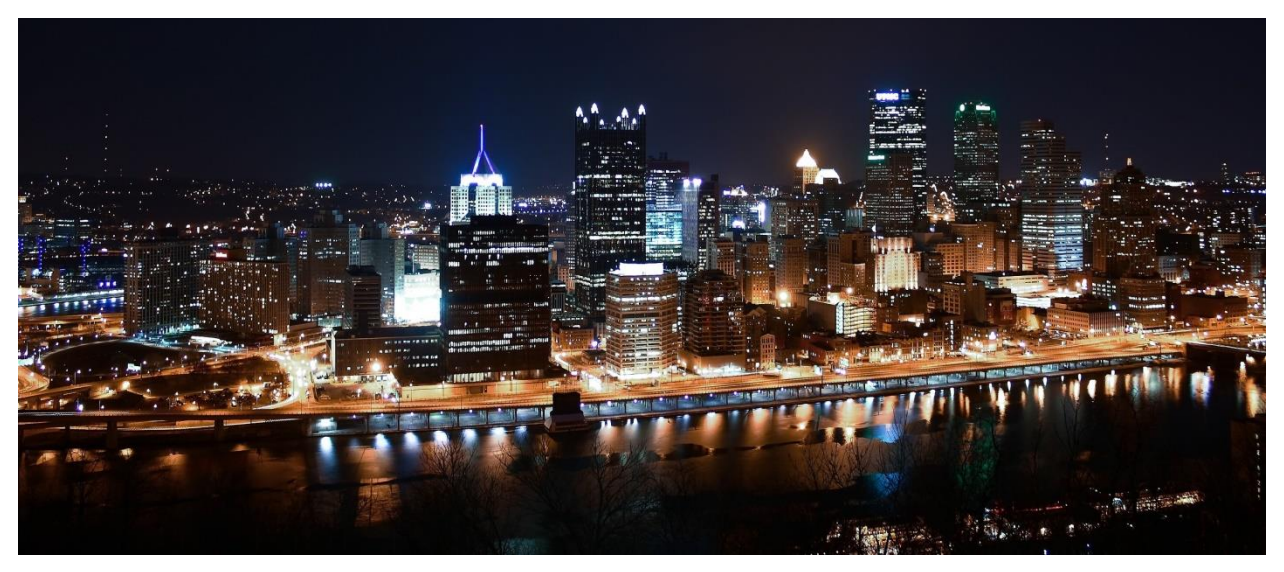
Pittsburgh Skyline at night