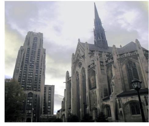
University of Pittsburgh