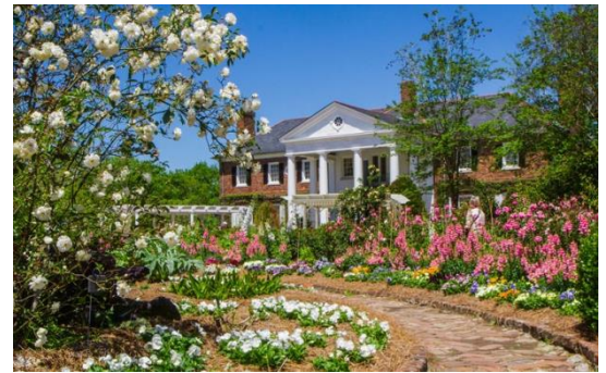
Boone Hall Plantation