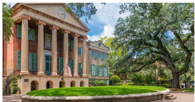
College of Charleston