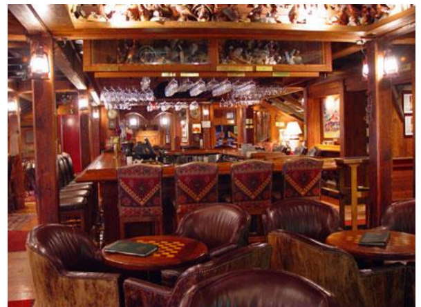
The Angus Barn