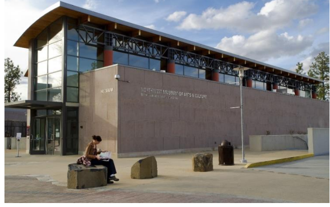
The Museum of Arts and Culture